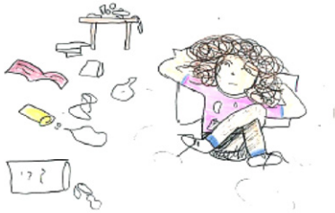
(b) She doesn't try hard enough ...