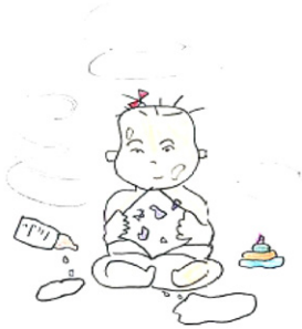
(a) She was born that way ...