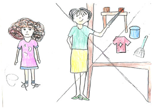
(c) She never had someone show or teach her...